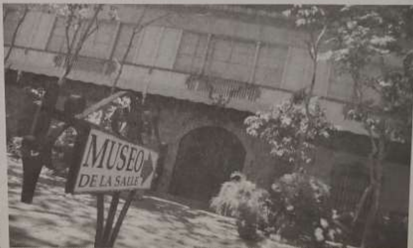
Museo De La Salle (MDLS), an on-campus museum of De La Salle University Dasmarinas (DLSU-D) will be the venue of the Luzon leg of Museum and Galleries Month 2010 celebration on Sept. 24. National Commission for Culture and the Arts-National Committee on Museums (NCCA-NCOM) partners with MDLS to bring the two events—an exhibit and a press conference.