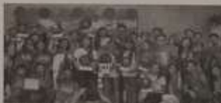
The delegation of the Schools Division of Cavite Province celebrates their 14th year of championship in journalism during the Calabarzon 2019 Regional Schools Press Conference (RSPC) in Calatagan Elementary School, Rizal province.

Campus journalism powerhouse Cavite province remained unshaken as it was hailed as Best Performing Schools Division in the recently concluded Regional Schools Press Conference (RSPC), completing its 14th straight victory