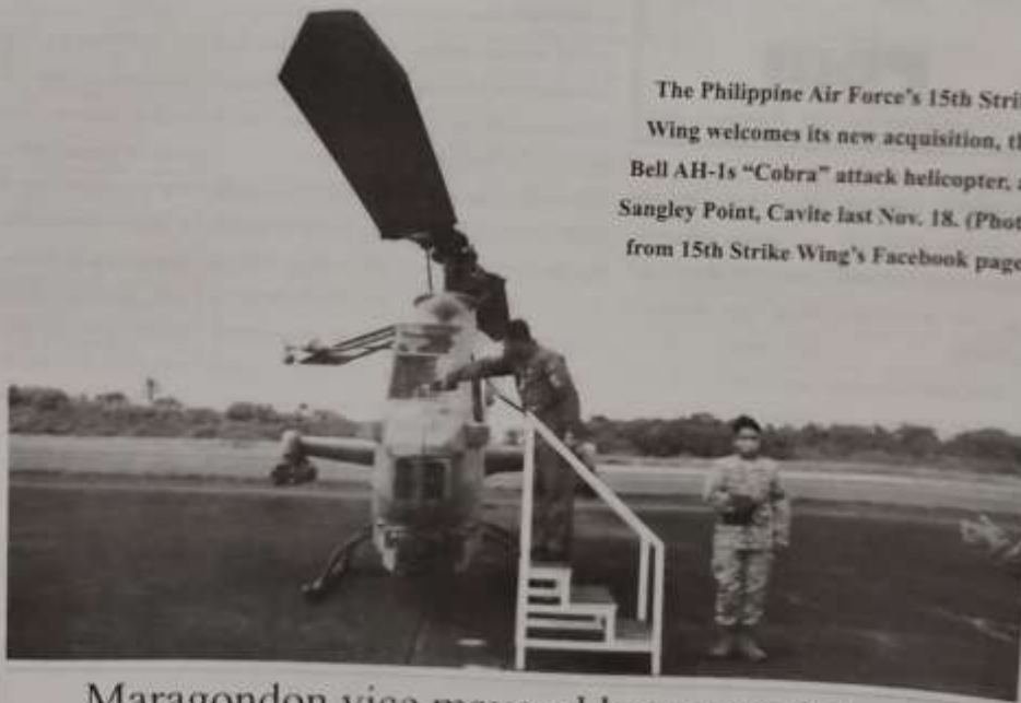
The Philippine Air Force's 15th Strike Wing welcomes its new acquisition, the Bell AH-1s "Cobra" attack helicopter, at Sangley Point, Cavite last Nov. 18.