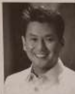
MALIKSI ignited Anti-COVID spokesman, said last March 11 that all measures against the virus

were being implemented, particularly in busy areas.