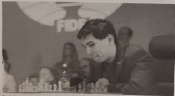
Carlsen hopes Wesley So will be joined by a powerhouse cast headlined by world champion Magnus Carlsen and legendary Garry Kasparov.

The Carlsen Invitational will be joined by a powerhouse cast, in-