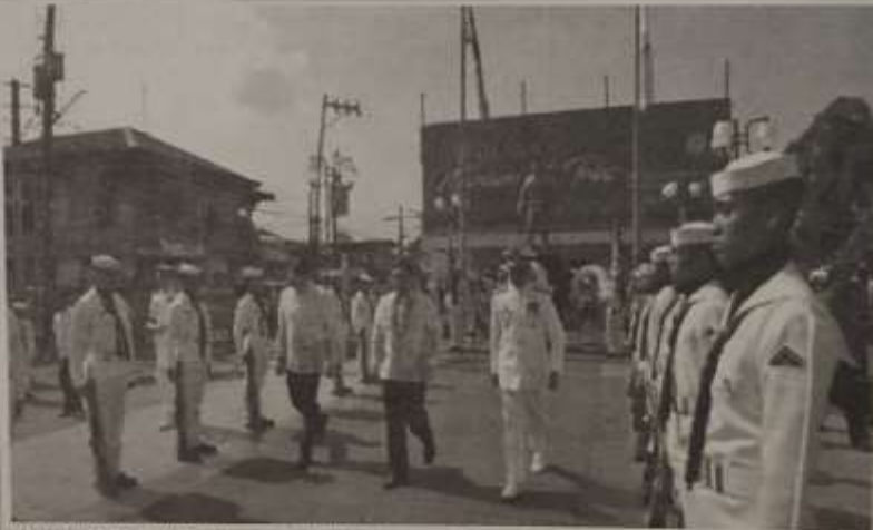
HOMAGE TO GEN. TRIAS. Metropolitan Manila Development Authority chair Danilo Lim leads the wreath-laying rite before the monument of Cavite's staunch defender and hero of the revolutionary movement, Gen. Mariano Trias, on the occasion of his 150th birth anniversary at the city plaza in General Trias City on Oct. 12, 2019. He was considered the first de facto Vice President of the Philippines during the revolutionary government established at the Tejeros Convention under Gen. Emilio Aguinaldo on March 25, 1897.