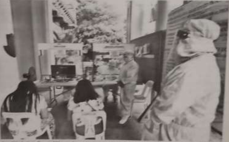
Health City Division offices in PPTs attend to new registrants at the city hall lobby during the ongoing registration that will end on September 26, 2023.

"Based on current data, Cavite is on the path of flattening the curve," he said.