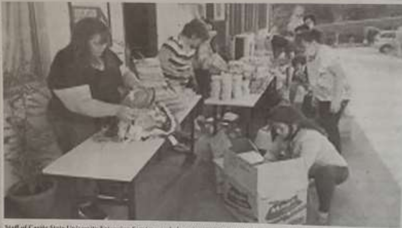
Staff of Carile State University Extension Services pack donations under its Relief program.